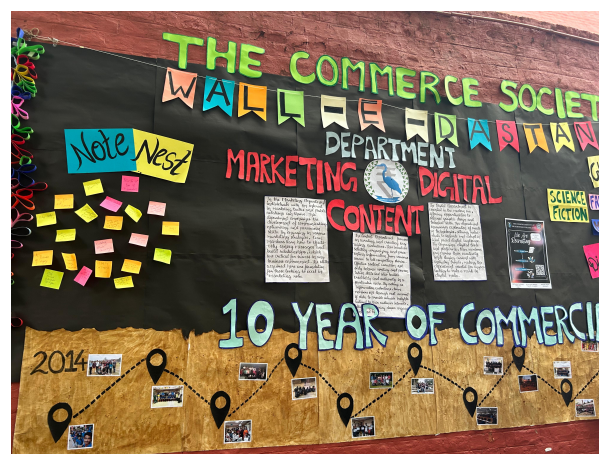
Wall-e-Dastaan showcasing milestones, achievements, and highlights of The Commerce Society

The Commerce Society celebrated Teachers Day together with the Principal and the faculty of the Department of Commerce. Meraki Society, the music society of the college, collaborated for a lively jamming session to bring a cheer of festivity to the event. The event was filled with music, fun, laughter, and light refreshments, making it an enjoyable and memorable occasion for all.