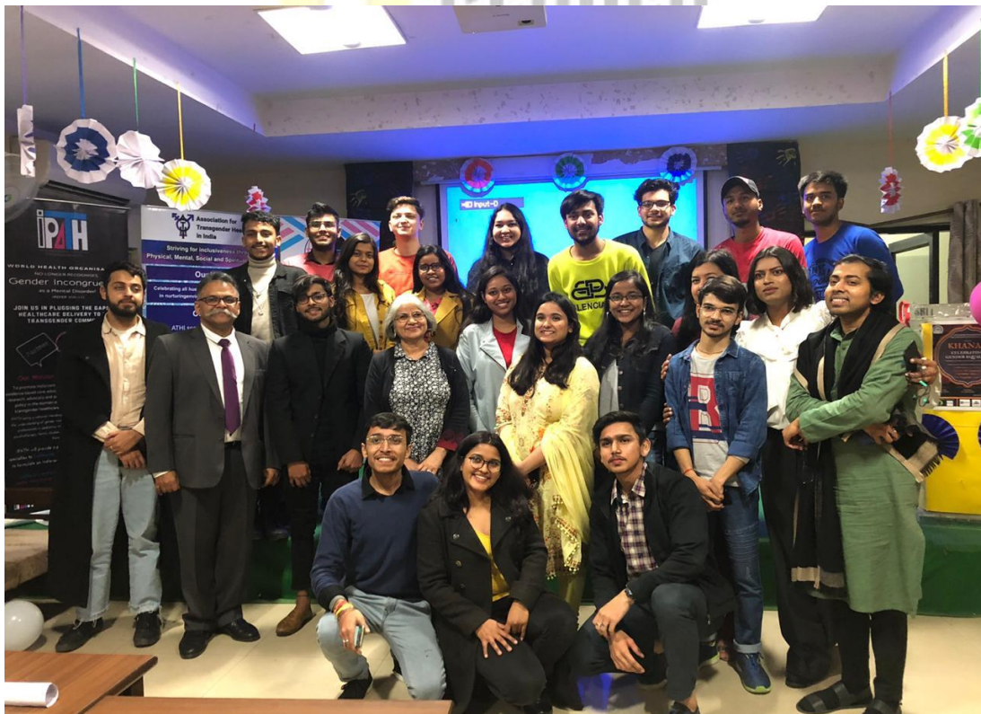
TEAM GENDER CHAMPIONS

Gender Championship Cell SACE indomitably believes in the above maxim and strives to effectively implement the above words in our actions. We at Gender Championship cell, aspire to build an egalitarian society, a society characterized by social equality and equal rights for all people irrespective of their sexuality, where the word ‘Humanity’ sways the hearts of people raising above of all gender stereotypes. We might have conquered the sky and defeated the waves of the ocean but even after being in the 21st century we haven’t conquered the gender dysphoria developed ages before due to lack of proper knowledge and understanding and with more of personal agony and experiences and blindly following those axioms we have crowned the LGBTQ+ (lesbian, gay, bisexual, trans, queer, and other sexualities) community as unnatural and threat for our civilization.