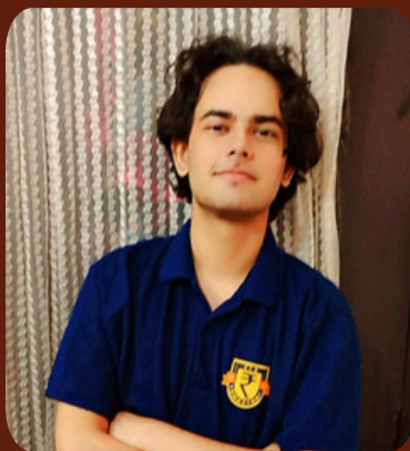
Utsav (Content Sub-head)