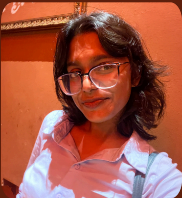
Palak (Digital Head)