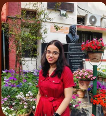
Pakhi (Digital Sub-head)