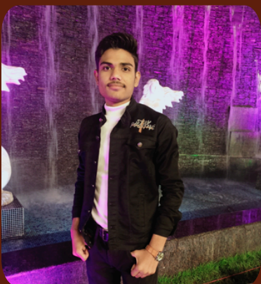
Prasang (PR Head)